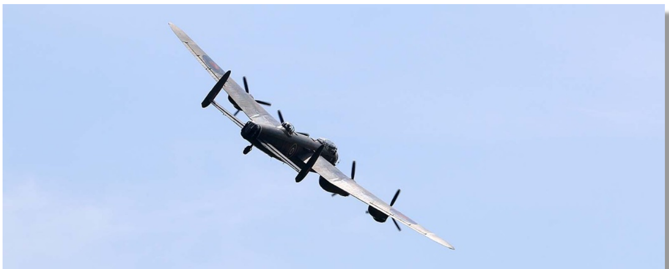
Leaving us after a final circuit