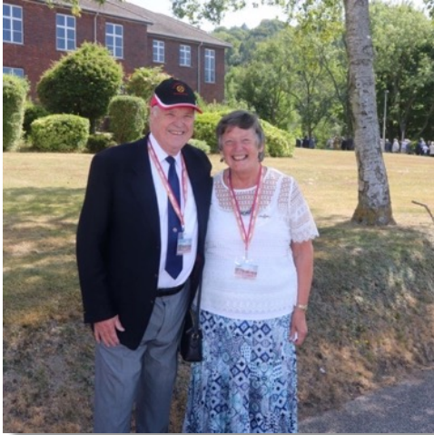
Some of the 90 th attendees enjoying their day