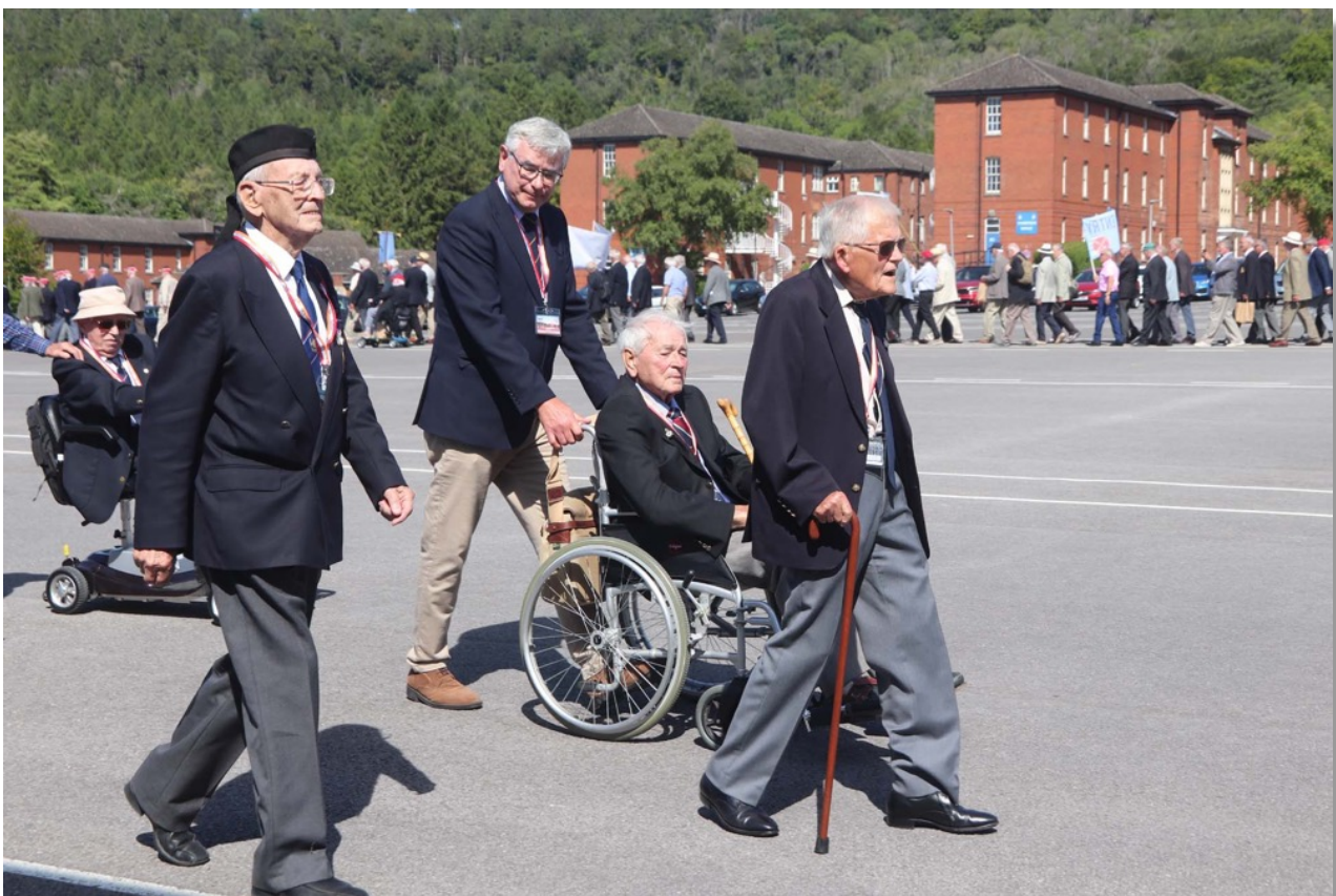
The most senior ex-apprentices led the Parade, including two from the 47 th Entry