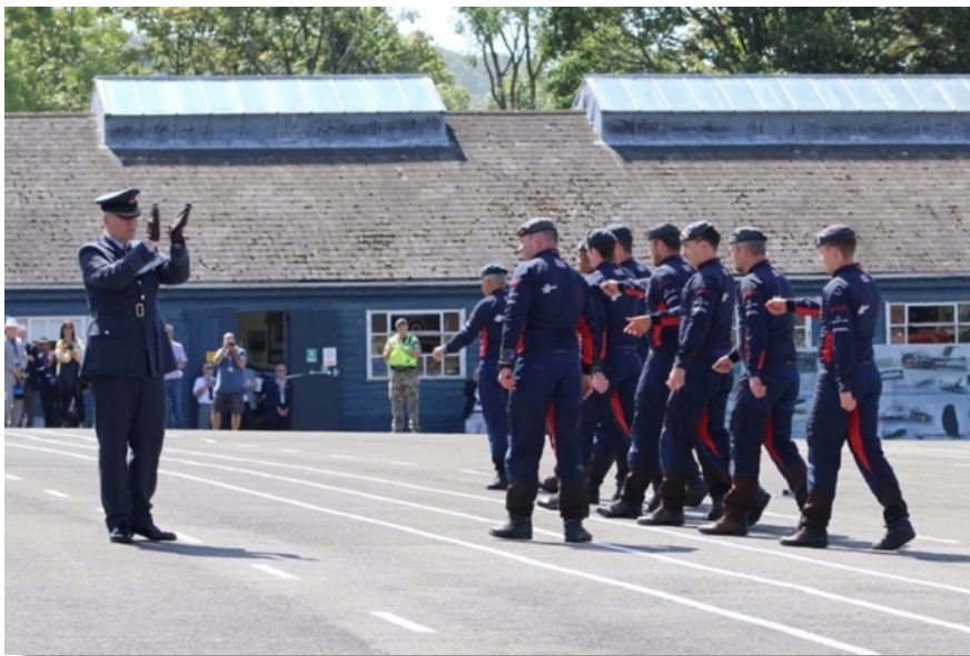
Return applause from him for their thrilling display