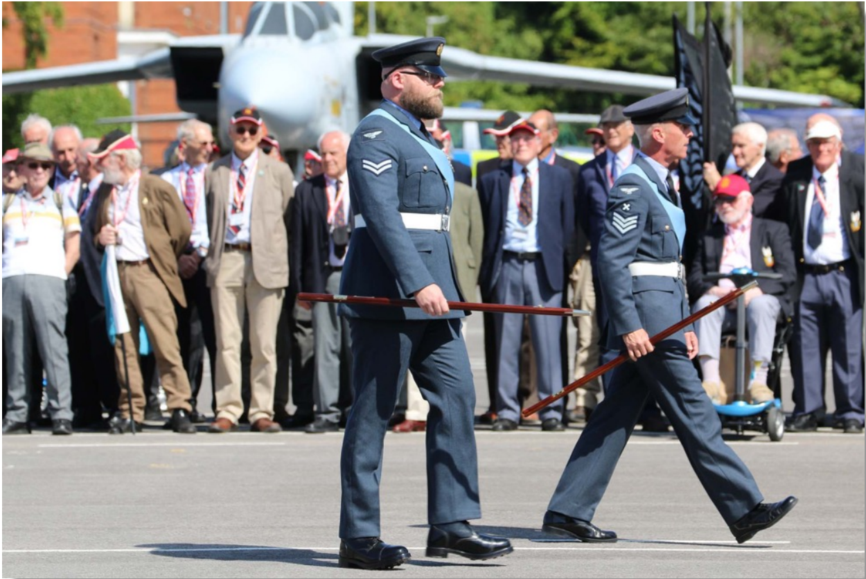
The DI's strutting their stuff with the 90 th Entry in the background.