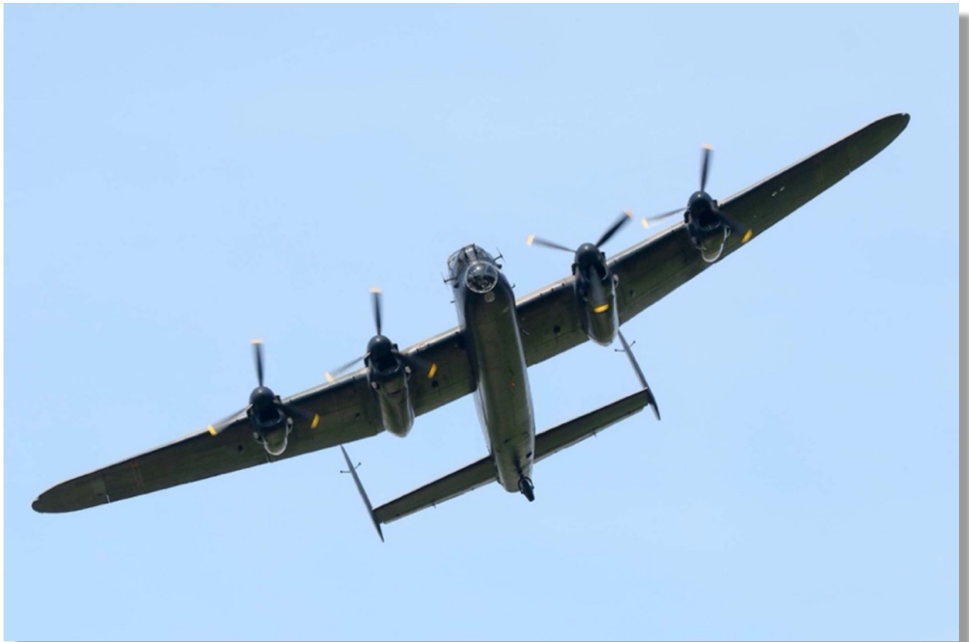
A brilliant shot of the BBMF Lancaster almost overhead