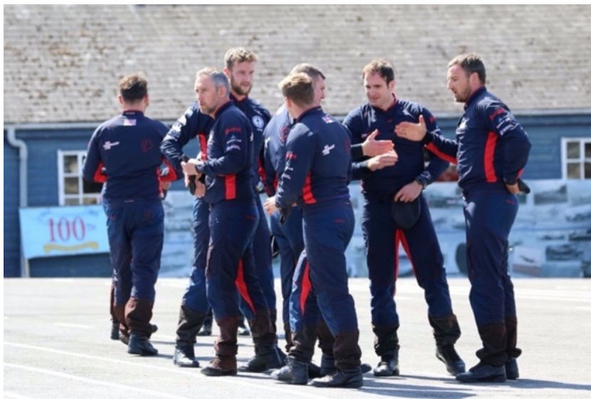
The Falcons Team showing their camaraderie