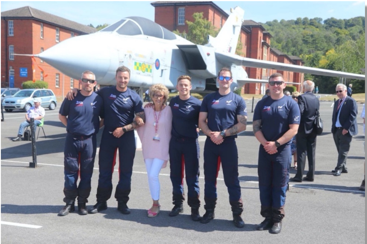
She tells me there had to be some reward for taking pictures all day.