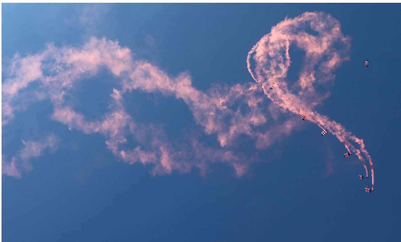
All seven lining up for display soon after exit