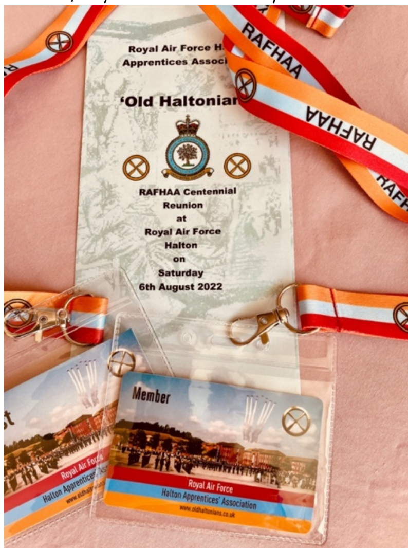
Members and guests were issued with a bespoke lanyard

I sent my better half on a mission to take photos of the occasion for Despatches. As a picture speaks a thousand words, they can tell their own story.