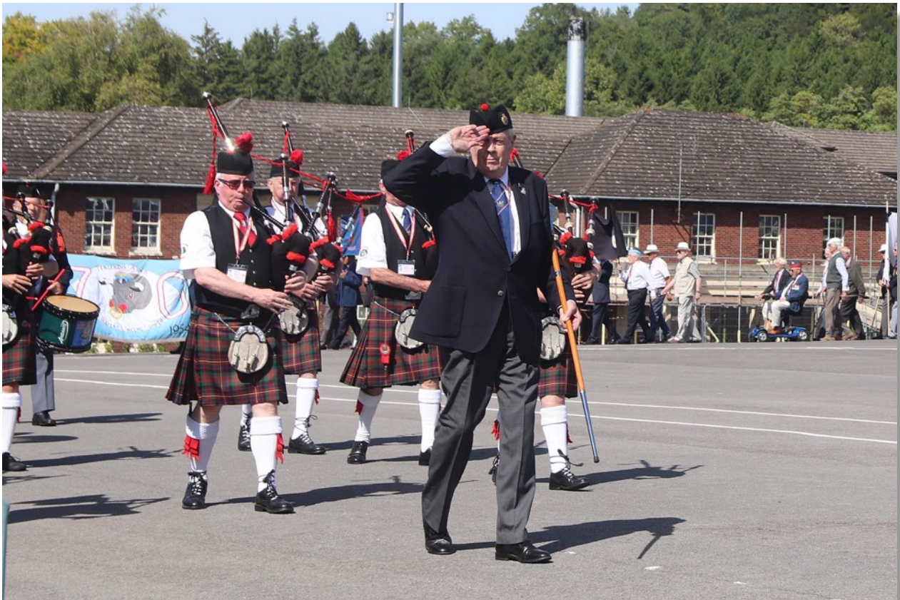
Eyes-right past the saluting base from the Golden Oldies Drum Major