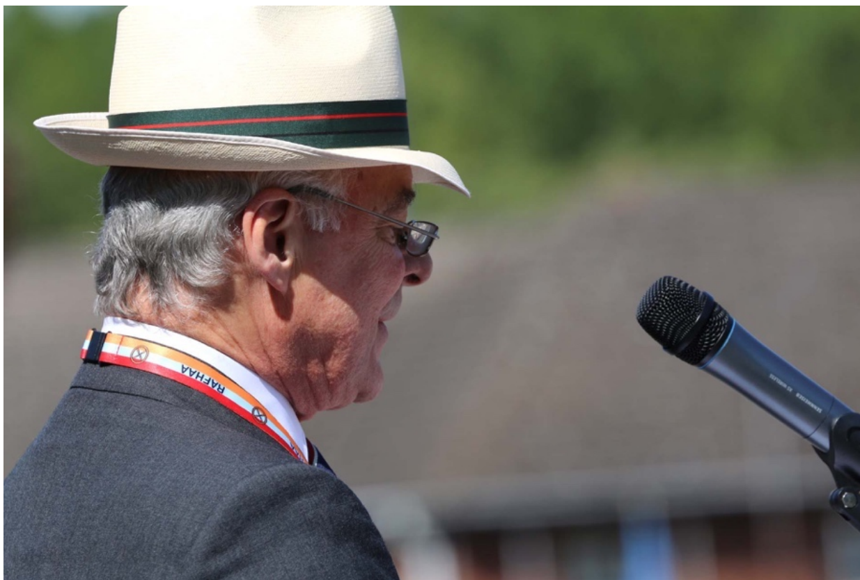
The Viscount Trenchard giving his speech.