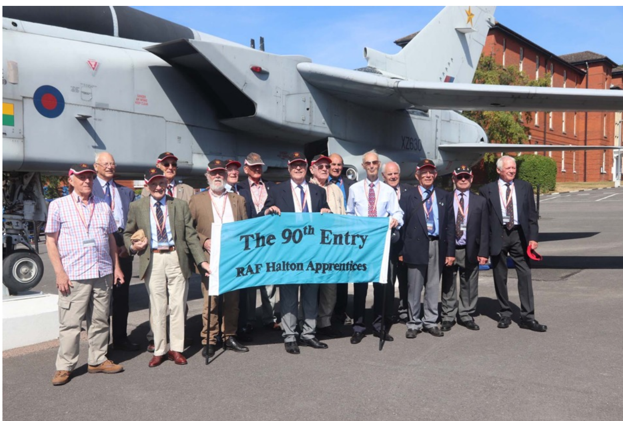
After the Parade we lined up for a photo - minus a few who escaped early.