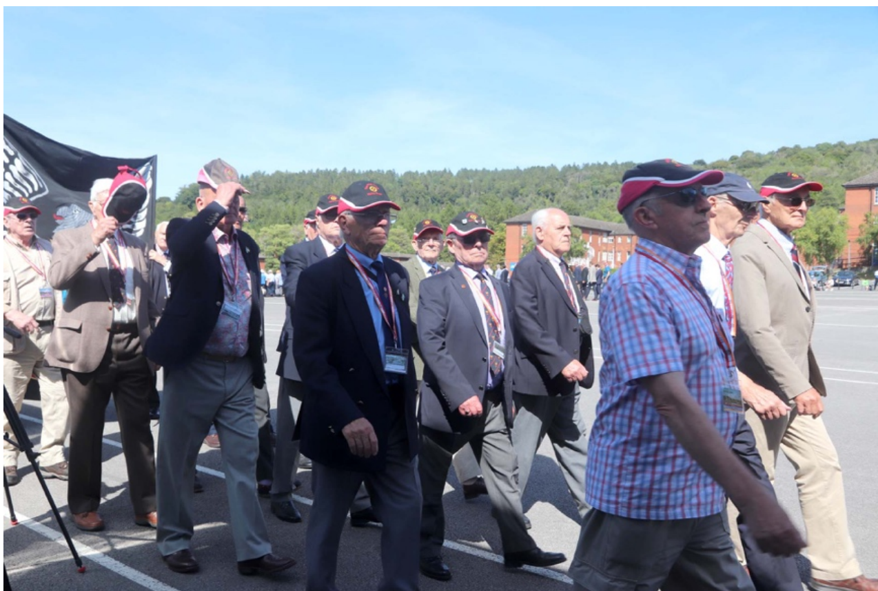
Some of the 90th passing the saluting base