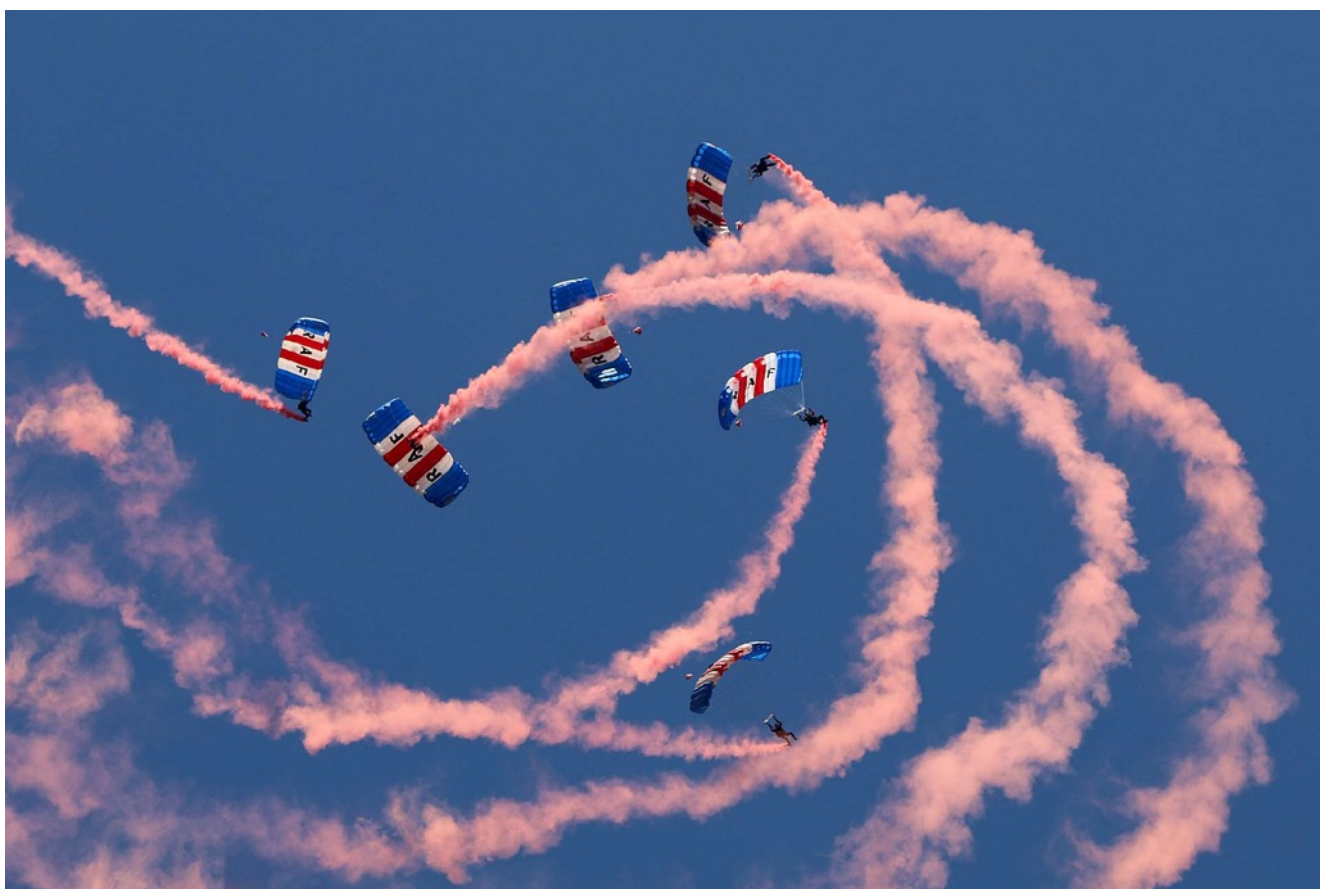
Part of the spectacular display. Unfortunately, a lack of space prevents showing lots more of equally impressive photos of their display.