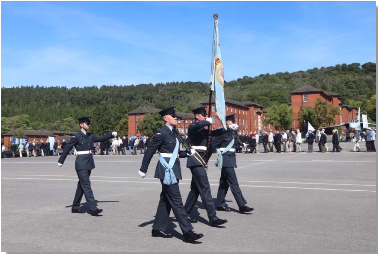
The Queen's colour paraded by trainees from RAF Cosford