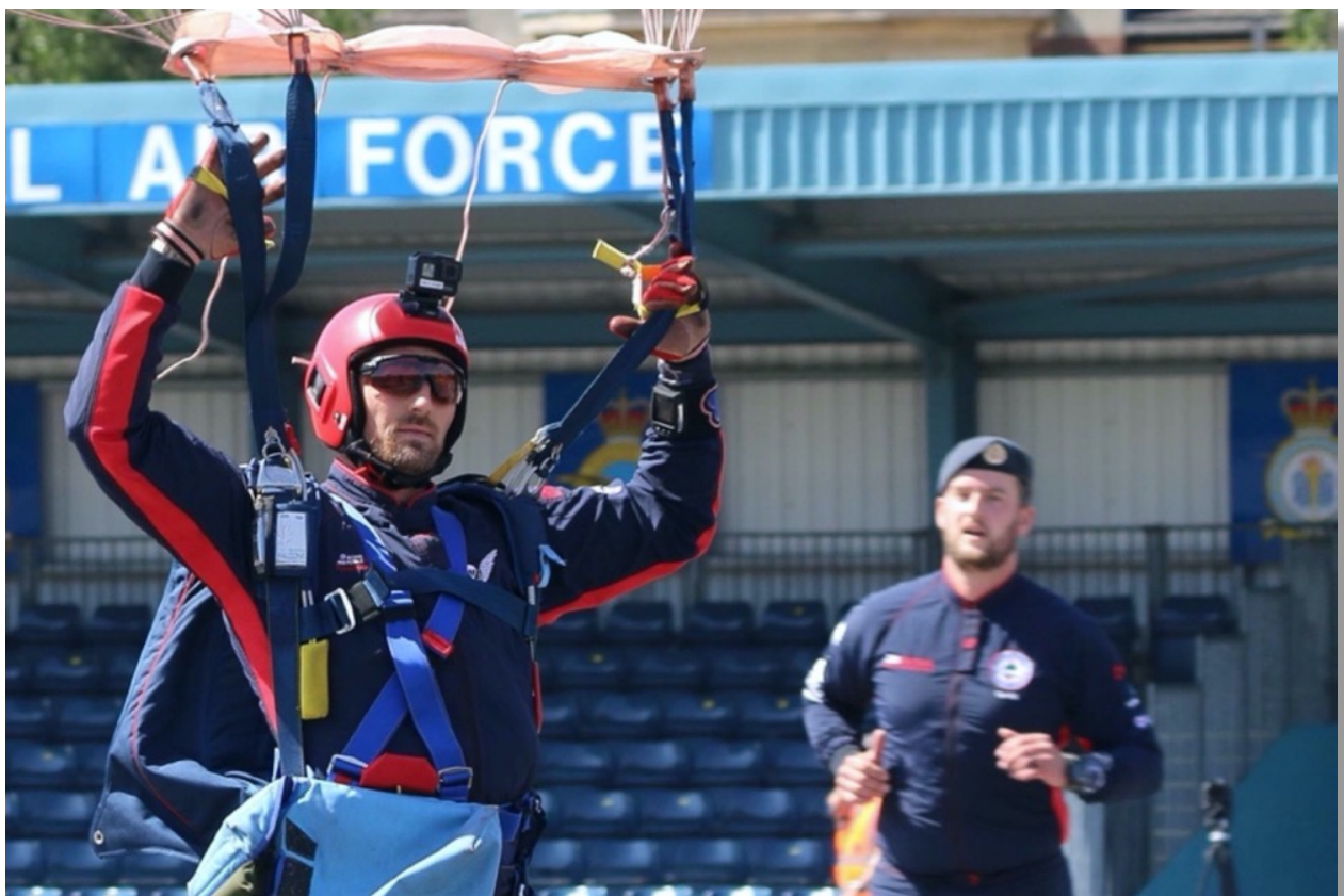
A spot-on landing