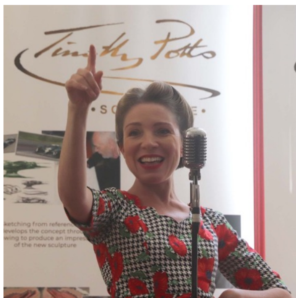
The D-Day Darlings with a costume change and another performance in the afternoon