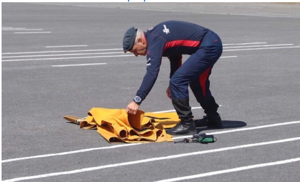
Preparing their marker on the Parade Square. The display was delayed a few minutes for lack of wind.