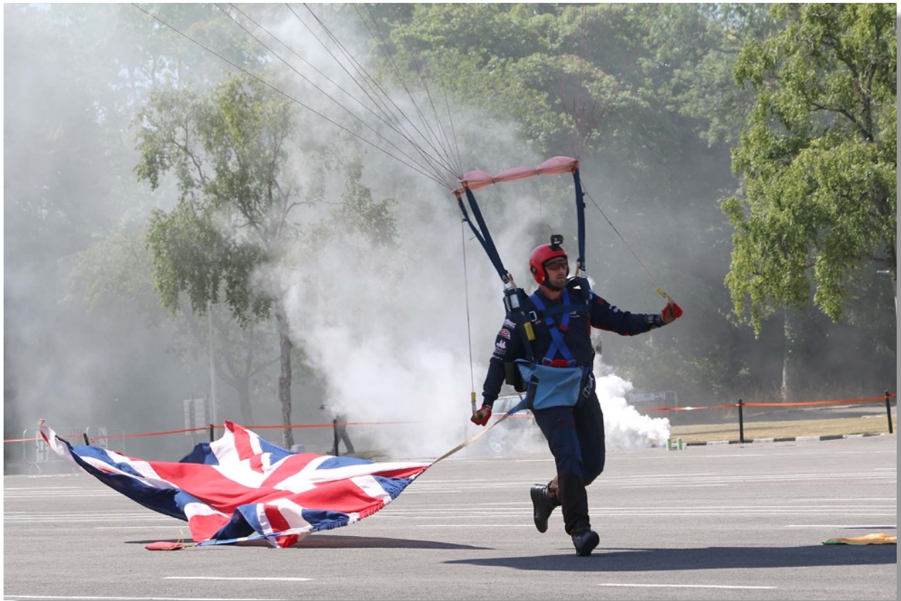
Making it look all so easy!