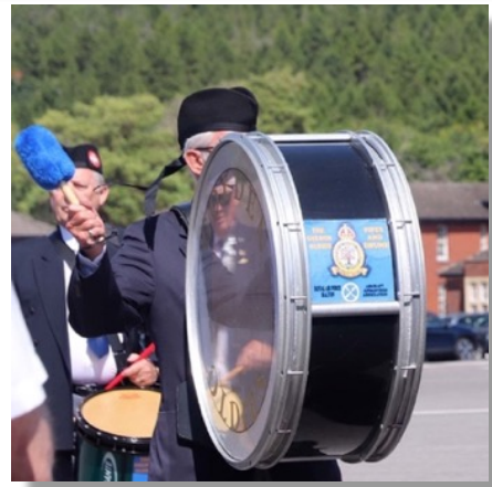
The Golden Oldies led the Parade, and performed both during the morning and afternoon in characteristic style