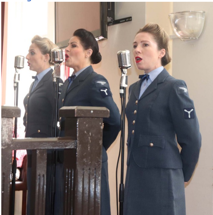
The D-Day Darlings entertained us in No. 1 Wing NAAFI (Tank) with suitably appropriate songs