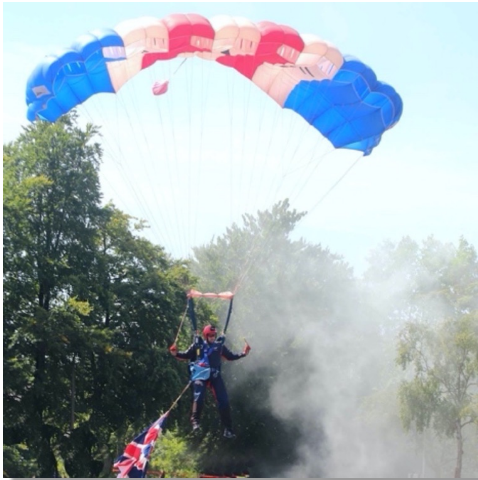
Coming into land on the Square from the 3 Wing direction.