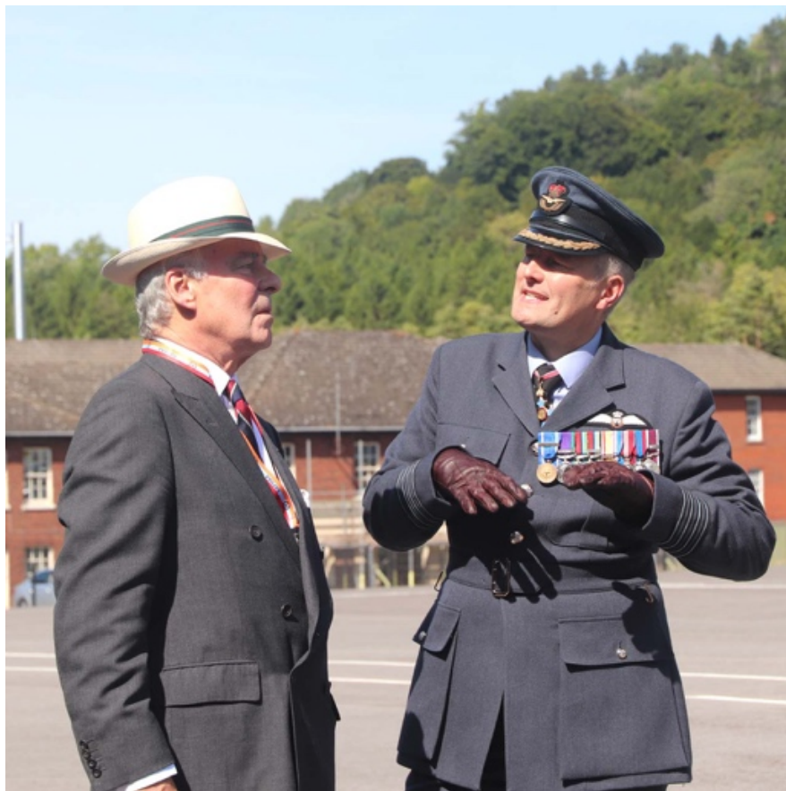
Viscount Trenchard with the Station Commander