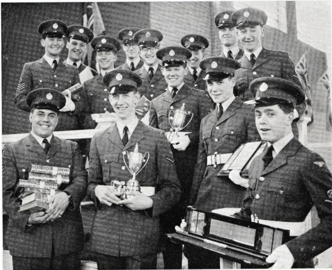
The Prize-winners . . . . .